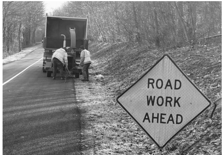
When we see road crews with "Road Work Ahead" signs along the road, please slow down and use caution. No one wants an accident!

and open and things are ready for our first winter storm.